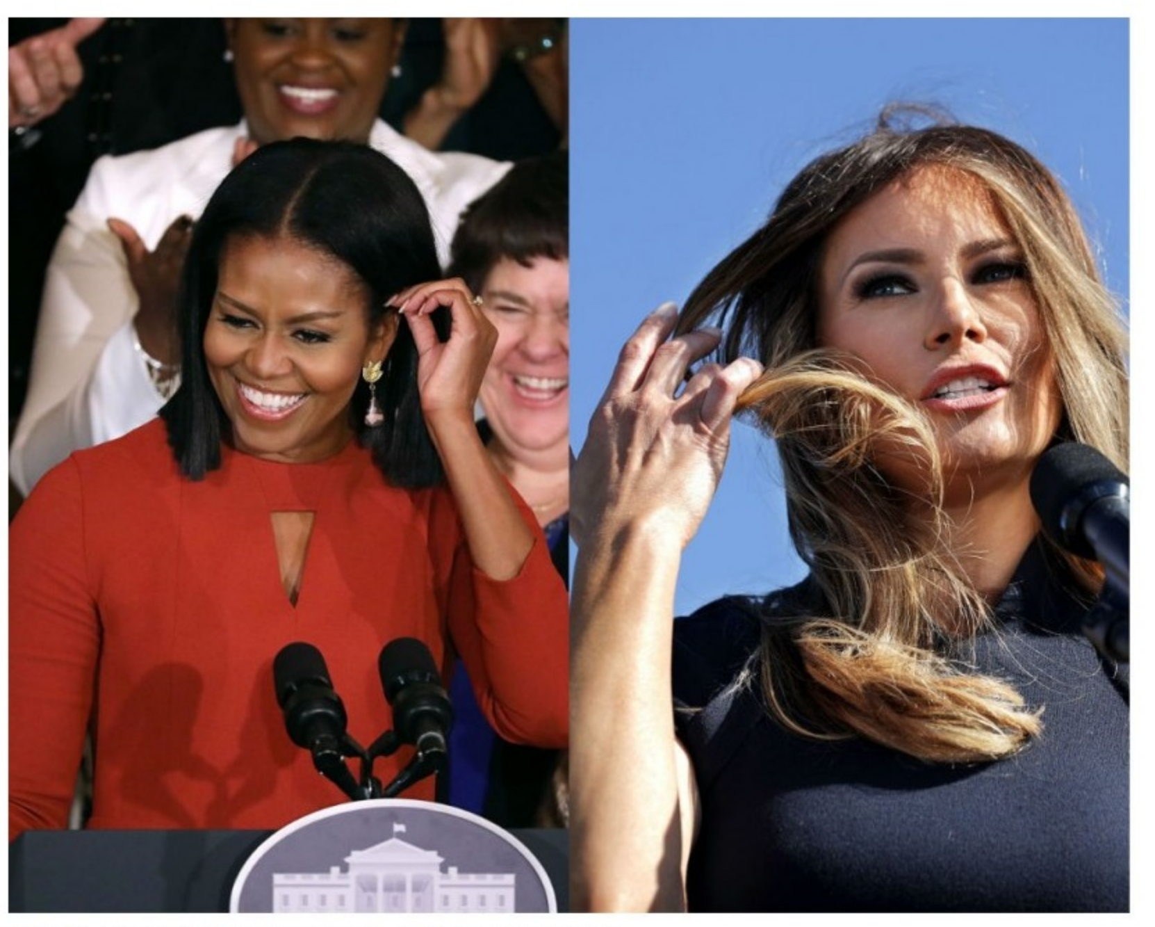
Melania Trump has big (and very fashionable) shoes to fill

There's no question among many people that Melania Trump has some big shoes to fill as the new FLOTUS of the U.S.--especially when it comes to fashion, something that Michelle Obama has indisputably set a high bar for.